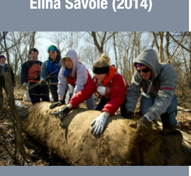
Alternative Spring Break Undergrads hard at work!