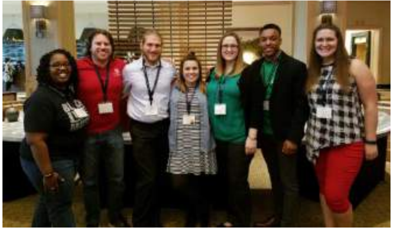
Redbirds at the 2017 Association of Student Conduct Administrators Annual Conference