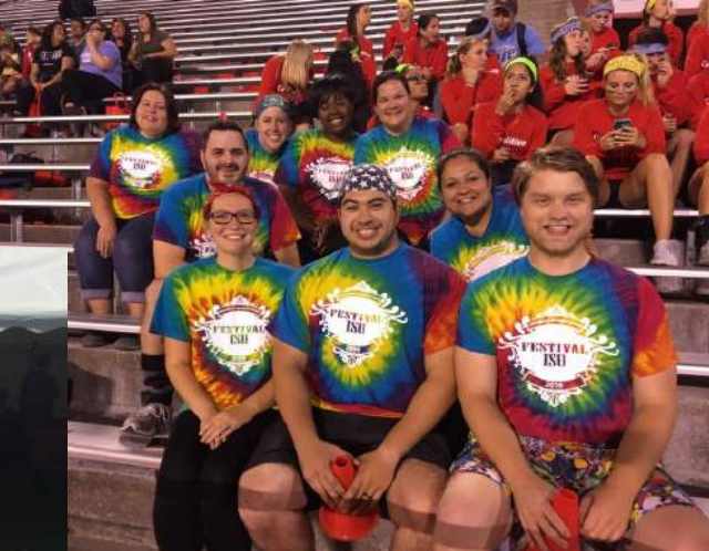
Dean of Students staff at Redbird Rumble