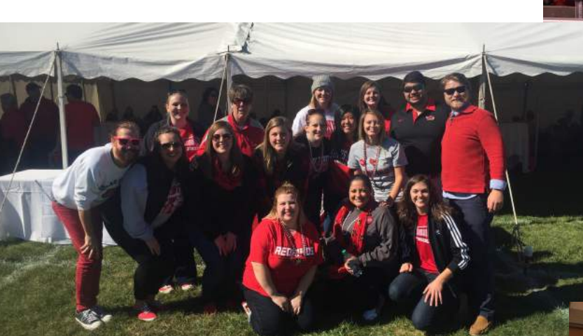
EAF Homecoming 2016